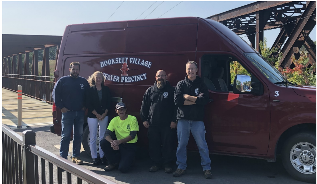
Hooksett Village Water Precinct